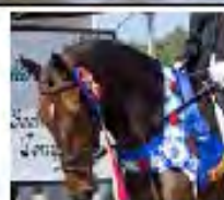
SOUTH July 19-21