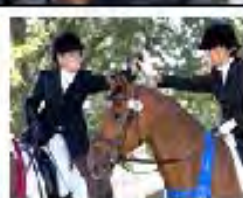
NORTH August 23-25