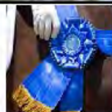
CENTRAL August 17-18